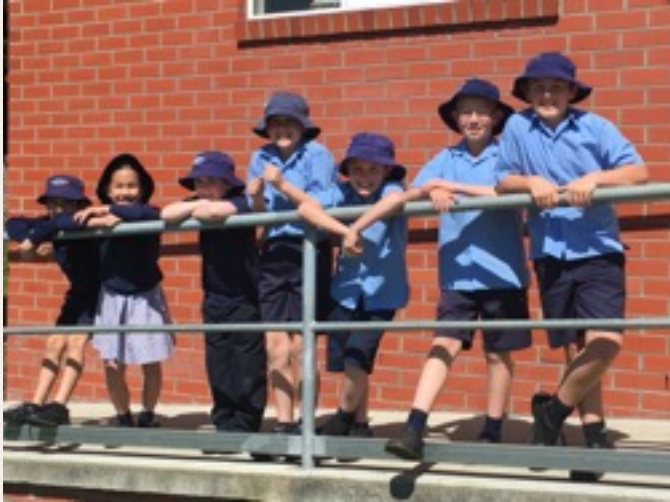
Enjoying the Hot Weather!