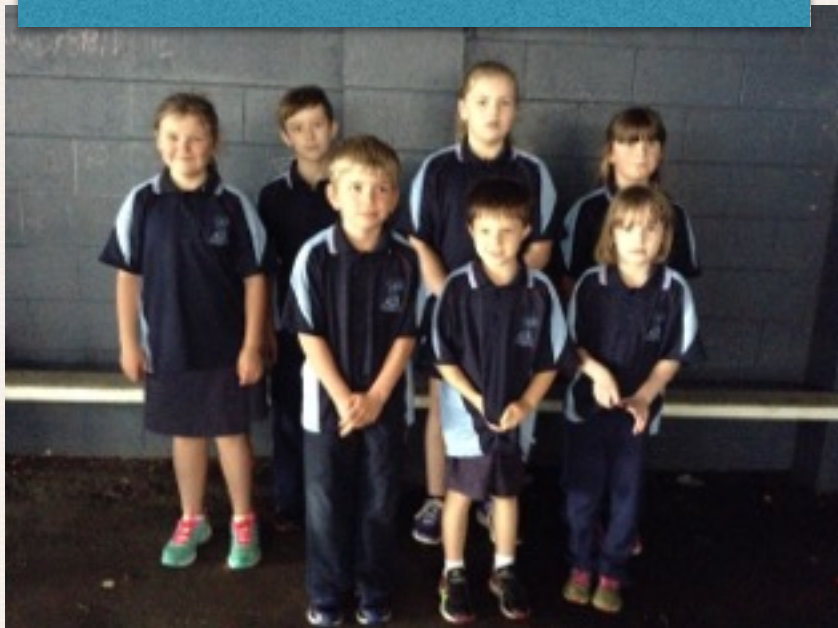
The new sports polo