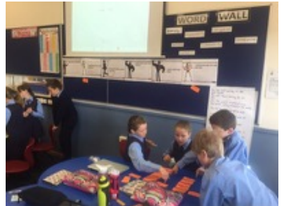
Students working collaboratively in Literacy.