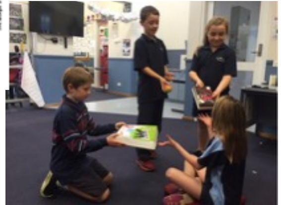
A role-play during one of our lessons on feelings and emotions.

We have some very enthusiastic junior geologists in Grade 4 at the moment! Our new topic for science is Changes on the surface of the Earth, in particular, Rocks! The students have begun exploring how Earth's surface changes by using the rock cycle as a central focus point. We have been learning to use scientific terms to describe key concepts and to explain that there are three main types of rock: sedimentary, igneous and metamorphic.