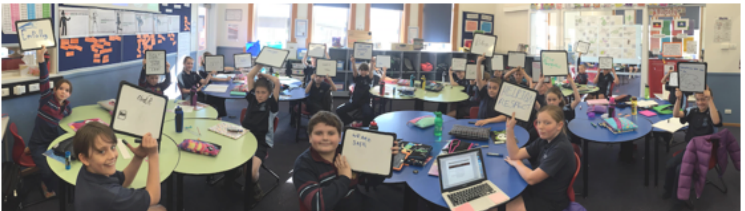
Whole class response assessment system.

Students are currently learning about the reasons for the Journey of the First Fleet. They are composing a historical recount about a convict in our colonial past. As in most subjects students are referring to an assessment rubric to guide their learning and provide feedback.