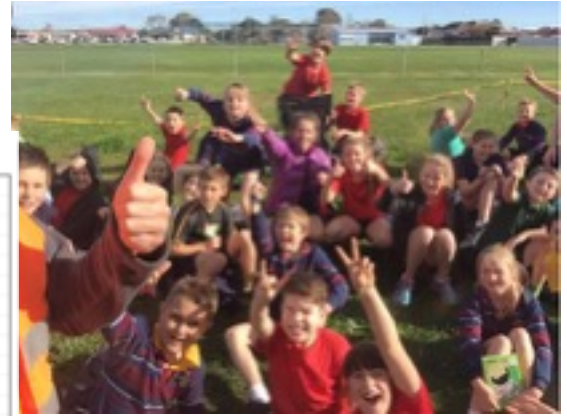
A photo of Grade 4 at Cross Country